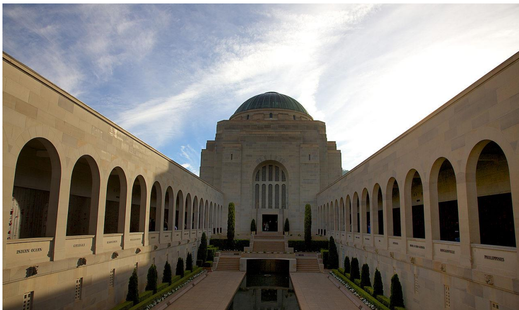
Commemorative Area of the Australian War Memorial